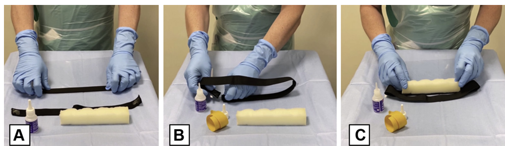
Figure 1. A. Affixing a self-adhesive stiff foam strip to the A4 acetate sheet. B. Affixing the ends of the 32- × 2-cm elastic band to the stiff foam strip and A4 acetate sheet with cyanoacrylate glue. C. Affixing the piece of packaging foam to the stiff foam strip and acetate sheet with cyanoacrylate glue.