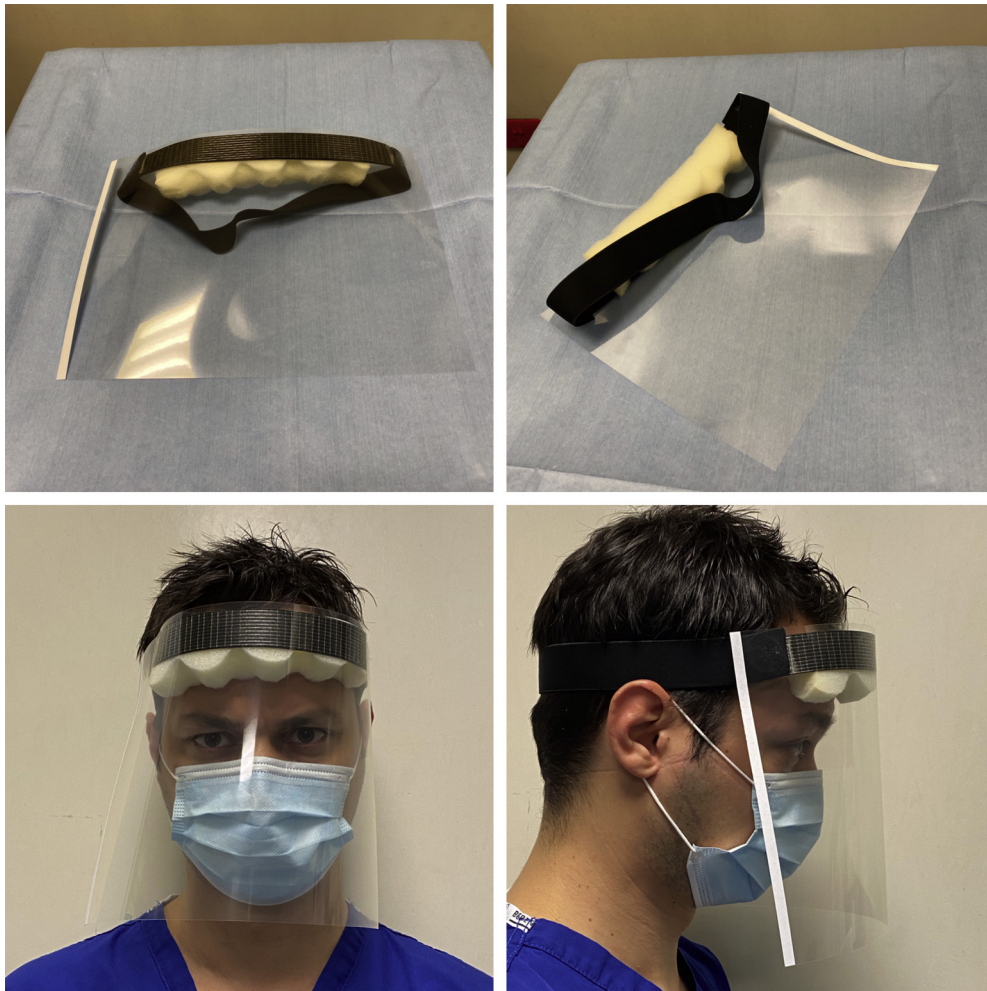
Figure 4. Simply constructed, inexpensive face shield, ready for use.