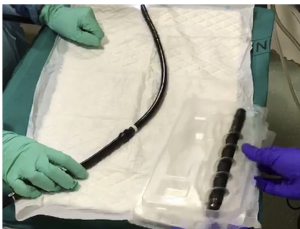
Figure 1. Enteroscope tube and spiral overtube.

Motorized spiral enteroscopy (MSE) represents a novel technique for the diagnosis and treatment of small-bowel diseases. Owing to rotation of a spiral overtube mounted