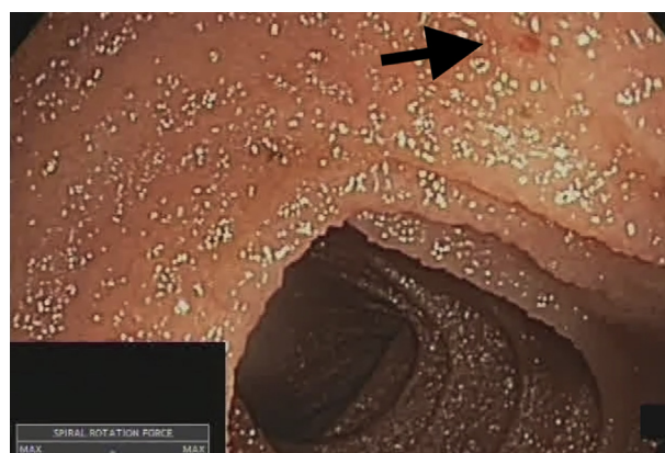
Figure 4. Diminutive angioectasia in the ileum (Type 1 b, Yano-Yamamoto Classification).