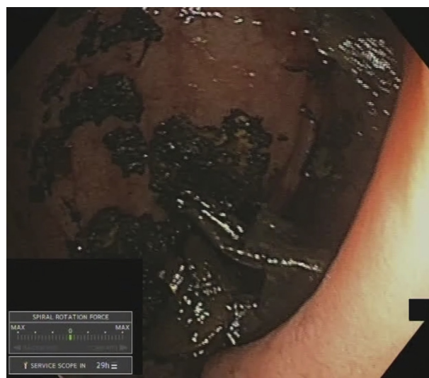
Figure 3. The tip of the enteroscope visualizes the cecum.